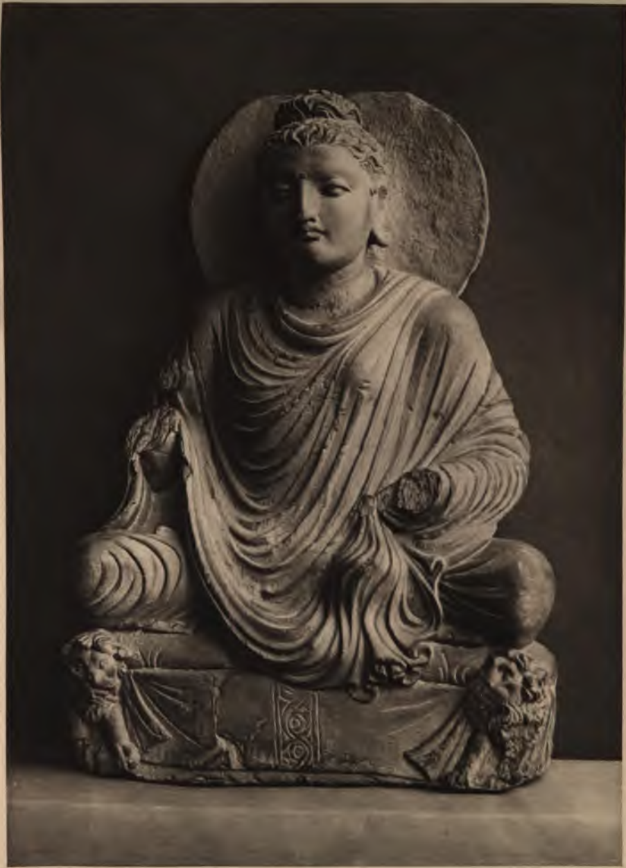
A Gandhara Buddha from Takht-i-Bahi See page XI